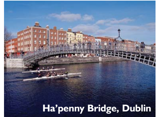
Ha'penny Bridge, Dublin

Day 1 We meet at our designated pick up points and transfer by coach to Holyhead for our afternoon Stenaline conventional ferry crossing to Dublin Port. On arrival we continue to the 4* Clarion Hotel Liffey Valley on the outskirts of Dublin for a two night stay on half board basis.